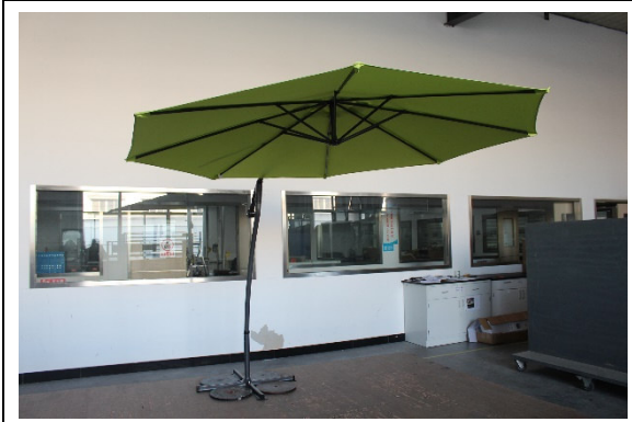
Sample as received - View 1