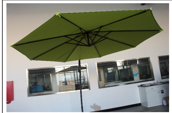
Sample as received - View 2