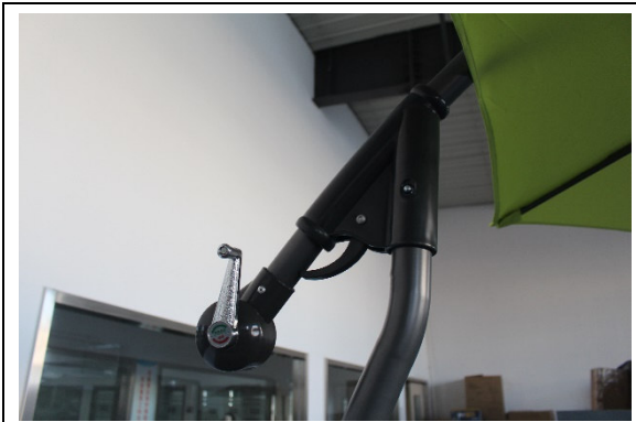
Sample as received - View 3