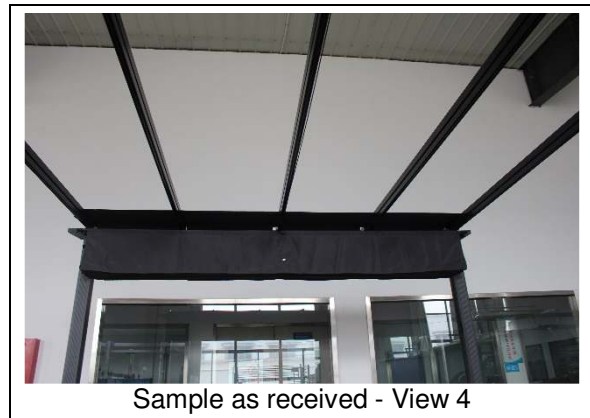
Sample as received - View 4