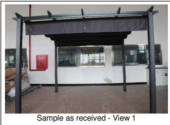
Sample as received - View 1