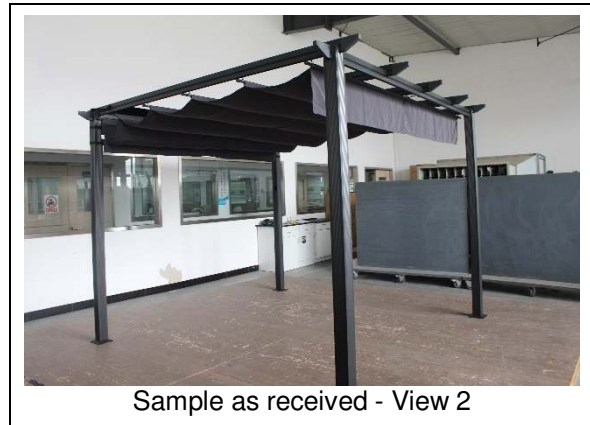
Sample as received - View 2