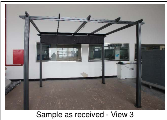
Sample as received - View 3